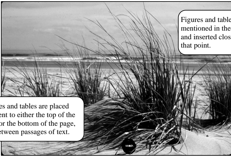
Figure 1. Trapping of Wind-Blown Sand by Vegetation

Figures and tables are mentioned in the text, and inserted close to that point.